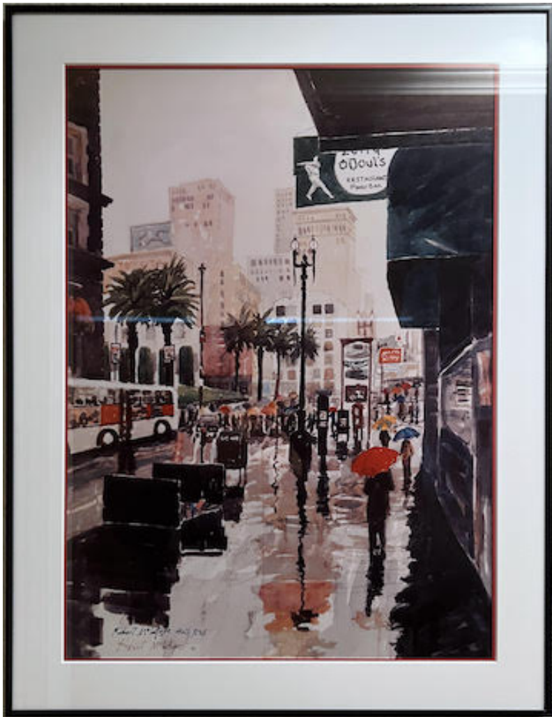
SF Rainy Day. Bob