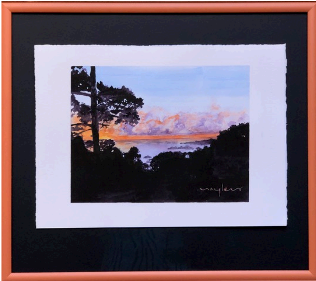
Sunset, Clouds Over Point Lobos. Suzette