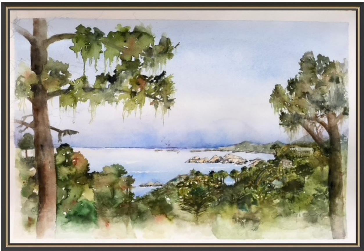
Our View. Suzette