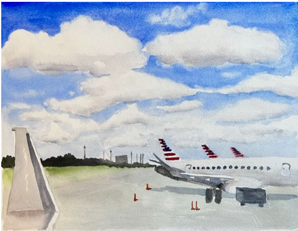
On the Tarmac. KC