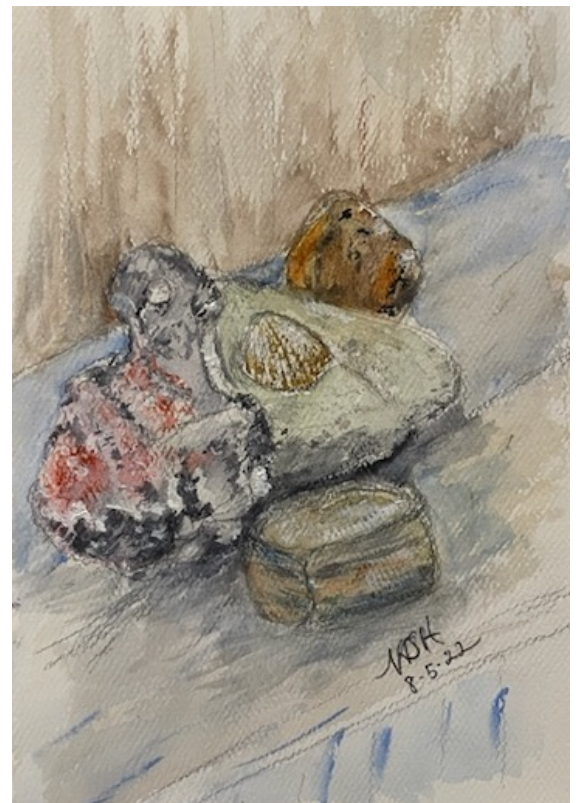
Beach Rocks. Nancy