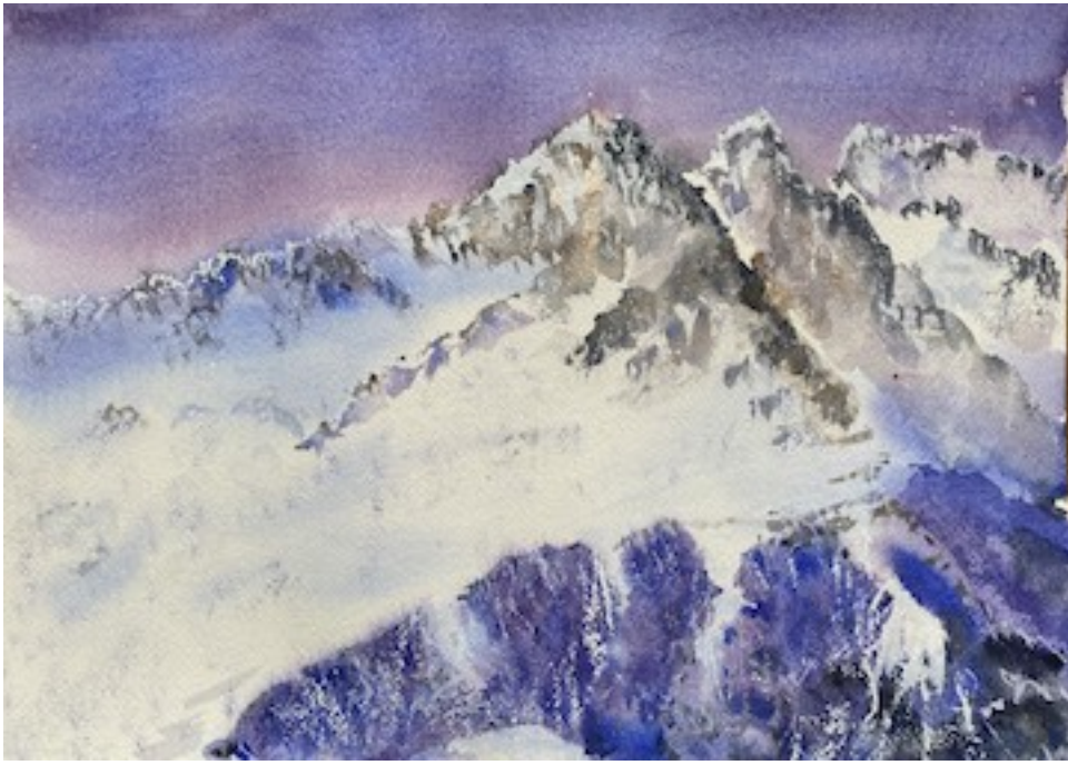
Snowy Mountain. Lynn