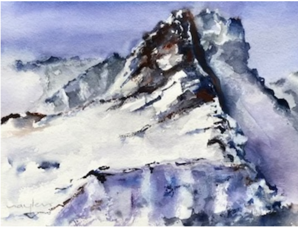
Snowy Mountain Peak. Suzette