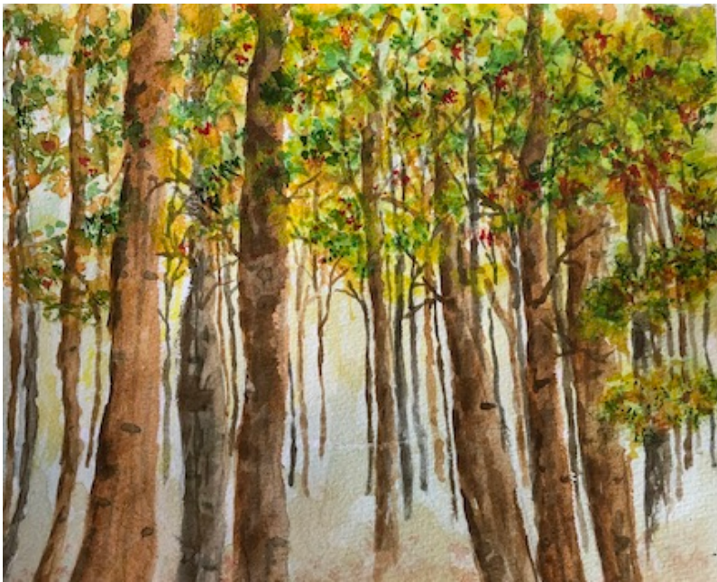
Autumn Trees. Mar