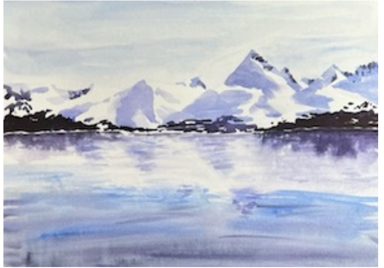
Prince William Sound.